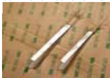
CONNECTION: SOLDERING RIBBON