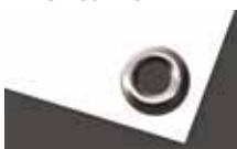
FIXING: STAINLESS STEEL EYELETS