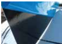
FIXING: DOUBLE SIDED TAPE