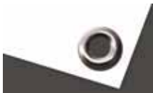
FIXING: STAINLESS STEEL EYELETS