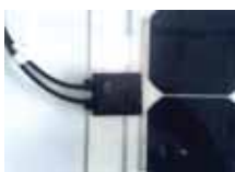
CONNECTION: JUNCTION BOX