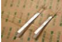
CONNECTION: SOLDERING RIBBON