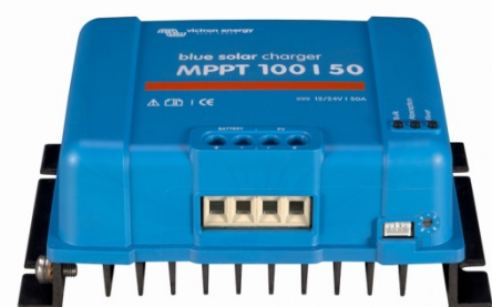
Solar charge controller MPPT 100/50